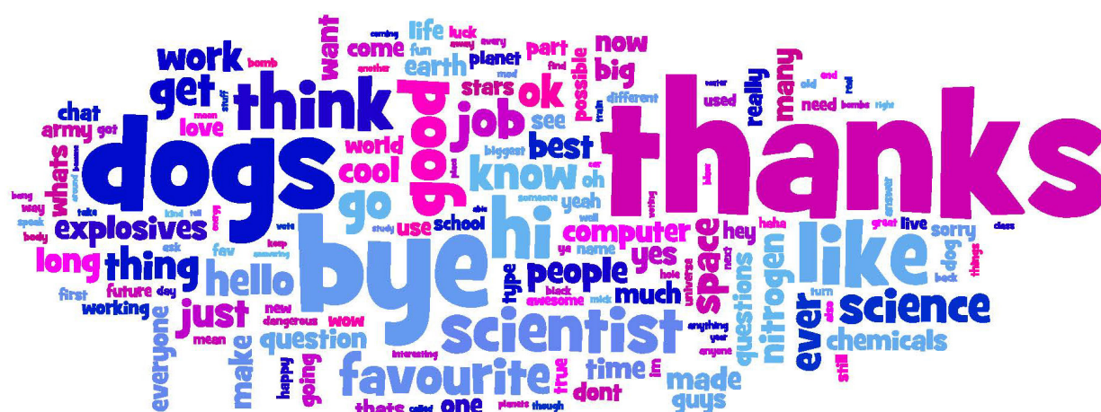
Diagram 2: A word cloud of the 150 most popular words used by students and scientists during the Live Chats in the I'm a Scientist Nitrogen zone. The more prominent the word, the more frequently it was used.

More personal and deeper questions also came through with the most popular question in terms of page views being “ is being gay/lesbian something that has gone wrong with the brain at birth or is it a choice ”. The Live Chats took a personal note too, with one student