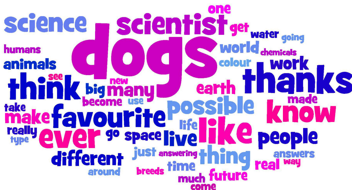
Diagram 1: A word cloud of the 50 most popular words used by students within the ASK section of the I'm a Scientist Nitrogen zone. The more prominent the word, the more frequently it was used by students.