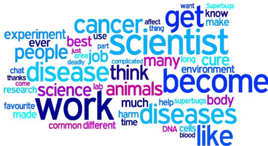
Diagram 1: A word cloud of the 50 most popular words used by students within the ASK section of the I'm a Scientist Disease zone. The more prominent the word, the more frequently it was used by students

Students displayed a significant interest in scientists specific job roles and one of the questions on the top of students lists was Why did you become a scientist? , asked by 38 students within the zone. It was great to see the variety of reasons why scientists followed their career path, and the different stages in their education that the passion for science took hold.