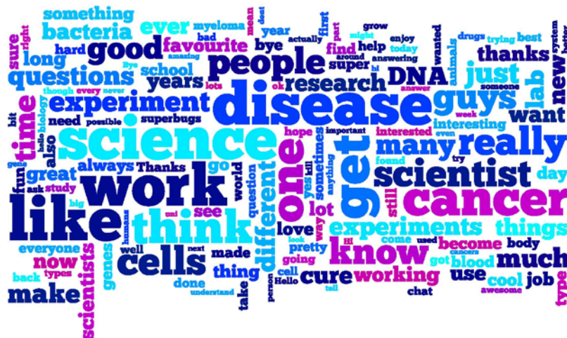
Diagram 2: A word cloud of the 150 most popular words used by students and scientists during the Live Chats in the I'm a Scientist Disease zone. The more prominent the word, the more frequently it was used.

The live chats were very busy and often had at least 3 scientists answering questions. Looking at the most popular words used within student's questions (diagram 1) and during live chats (diagram 2) we can see that disease , cancer , experiment and job/work featured high in their conversational vocabulary with the scientists.