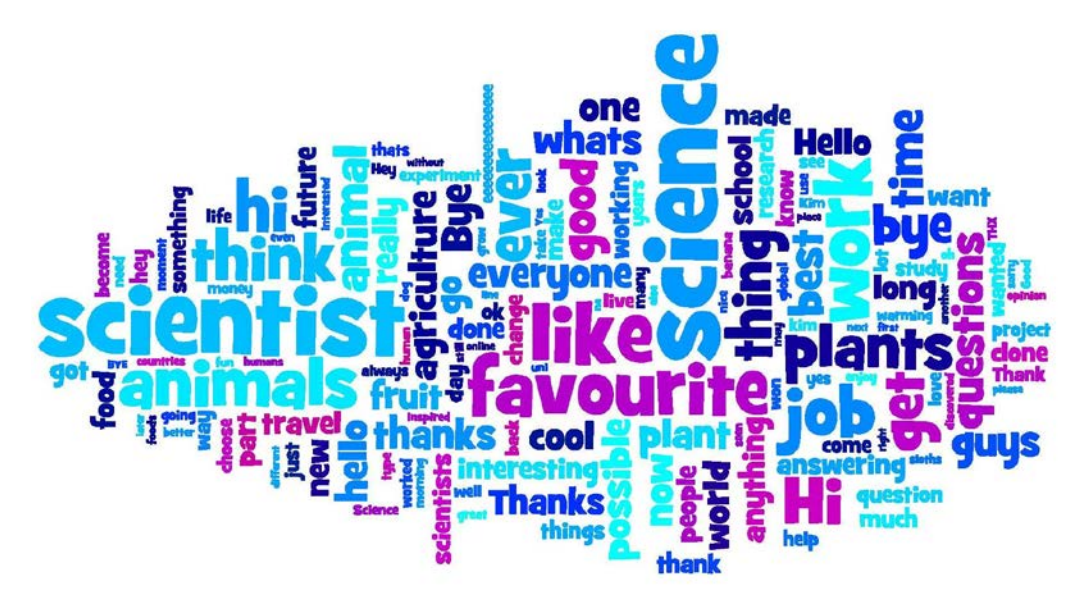
Diagram 2: A word cloud of the 150 most popular words used by students and scientists during the Live Chats in the I'm a Scientist Agriculture zone. The more prominent the word, the more frequently it was used.