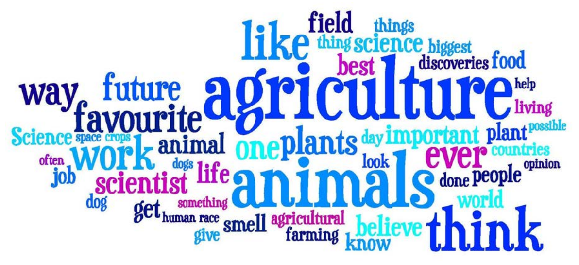
Diagram 1: A word cloud of the 50 most popular words used by students within the ASK section of the I'm a Scientist Agriculture zone. The more prominent the word, the more frequently it was used by students.

Students were also interested in what it's like to pursue a career in science "Science is one of my best subjects and I was wondering what it's like to study it in university" and the sense of fulfilment scientists get from their work "do you enjoy your work? and why?" and "if you couldn't be a scientist what would you be".